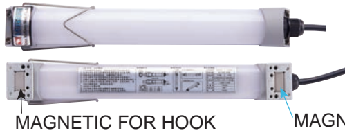
MAGNETIC FOR HOOK