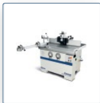
Table router minimax tw 55es

Professional artisan machine with swiveling spindle and four speeds