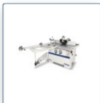
Table router minimax twf 55es

Professional artisan machine with swiveling spindle and four speeds