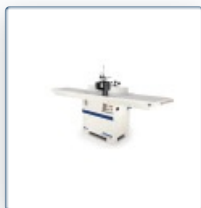
Table router minimax t 55 es LL M Digital

The professional craftsman machine with motorized height-adjustable and swiveling milling spindle and four speeds.