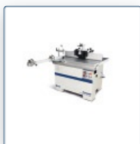
Table router minimax tw 55es M digital

Professional handyman machine with motorized height and incline adjustment of the milling spindle and four speeds