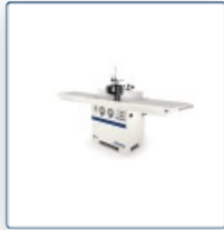
Table router minimax t 55 es LL

The professional artisan machine with swiveling spindle and four speeds