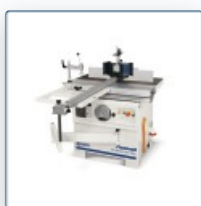
Table router minimax twf 45c

With aluminum sliding carriage and swiveling milling spindle - high performance with low investment