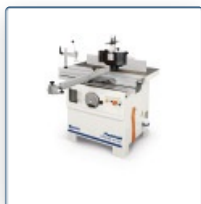
Table router minimax tw 45c

With aluminum sliding carriage and swiveling milling spindle - high performance with low investment