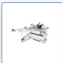
Table router minimax twf 55es M digital

Professional handyman machine with motorized height and incline adjustment of the milling spindle and four speeds