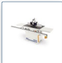
Table router minimax t 45c LL

Inexpensive, with rigid milling spindle and gray cast iron worktable