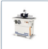
Table router minimax t 45c

Inexpensive, with rigid milling spindle and gray cast iron worktable