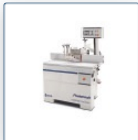
Table router minimax tw 55 es M 3 UP

Professional handyman machine with motorized height and incline adjustment of the milling spindle, four speeds and electronic control