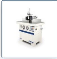
Table router minimax t 55 es

The professional artisan machine with swiveling spindle and four speeds