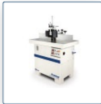
Table router minimax t 55 es M Digital

The professional craftsman machine with motorized height-adjustable and swiveling milling spindle and four speeds.