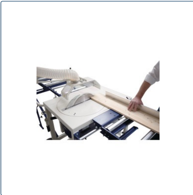
Saw blade rotation of up to 90° (illustration shows extension arm set available as accessory, 5741404)