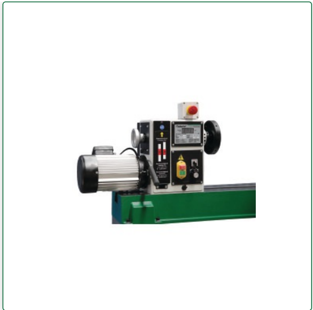
Variable speed control from 0-1200 rpm (L) and 0-3200 rpm (H) in two speeds