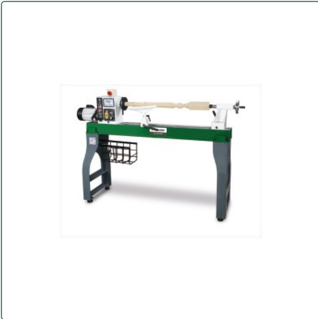
Picture shows accessories tool holder