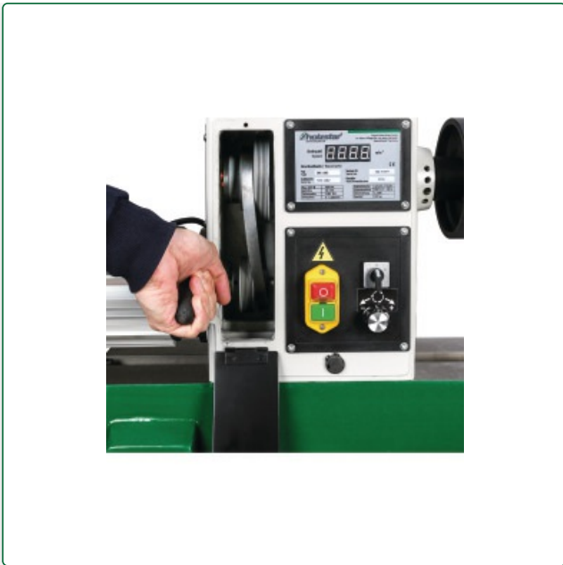
No tools required to change the gear ratio due to easy shifting of the V-belt