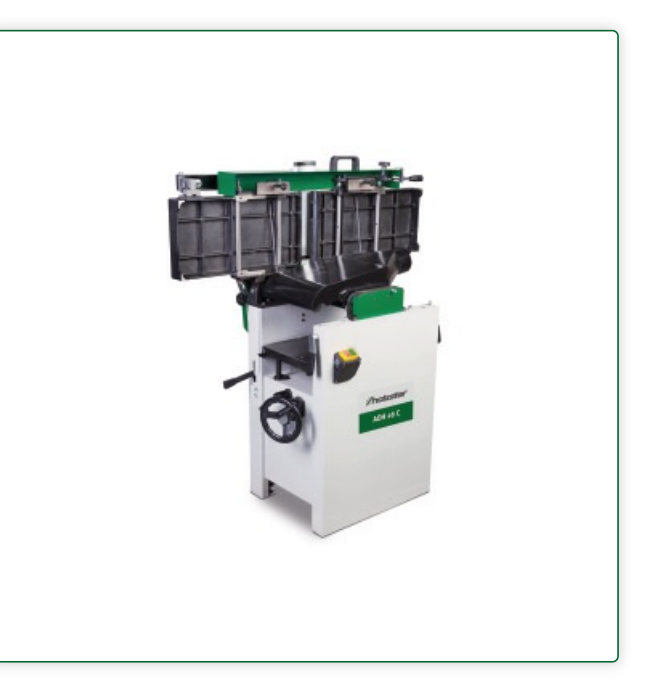
Equipped for thicknessing