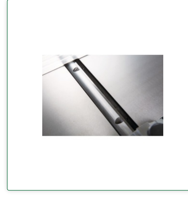
The integrated suction connection ensures a clear view when dressing / planing