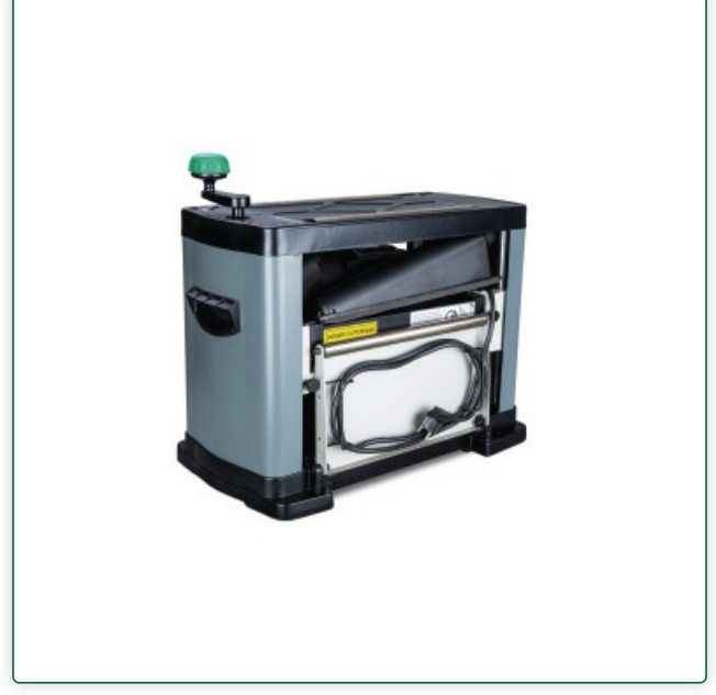
Small footprint with tables folded in, and thus easily stored