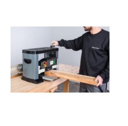
Easy to transport and thus ideal for mobile use