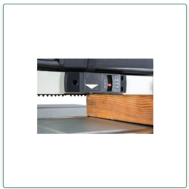
Mechanical material removal display