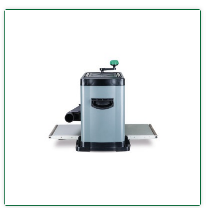
Space-saving design – length only 640 mm with tables folded out