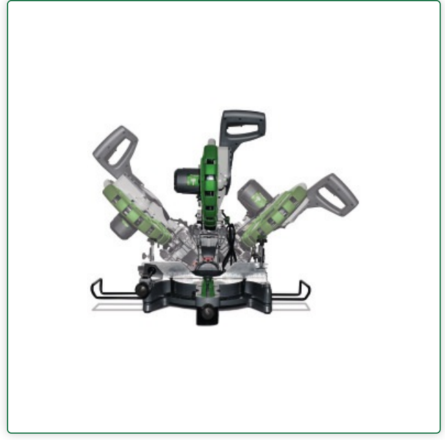
Laser projection on the workpiece for precise control of the cutting position