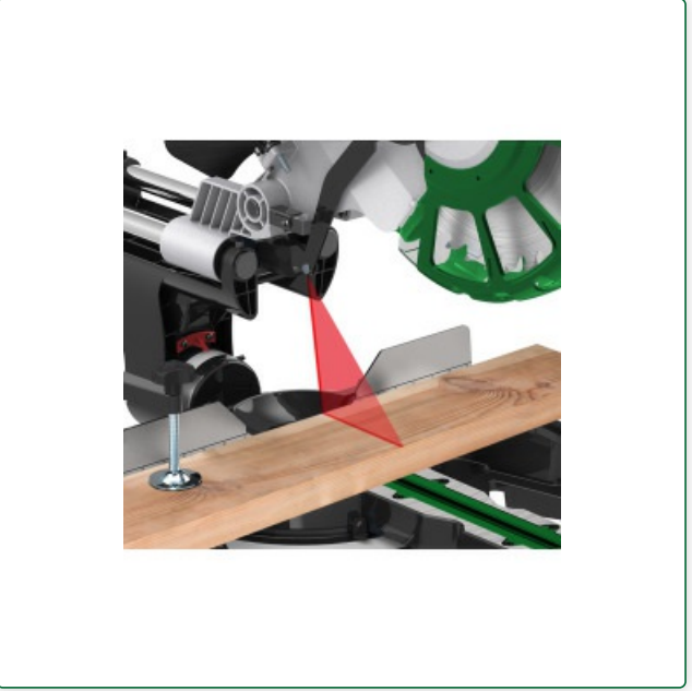
Adjustable stop rails as well as laterally extendable support aids right and left