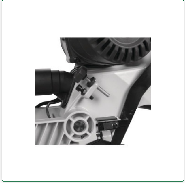
Dual adjustable chop depth limiter