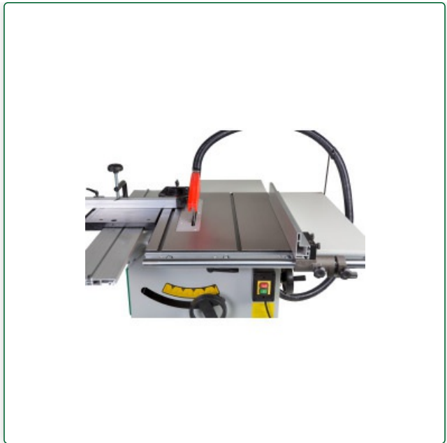
Parallel fence with round bar guide