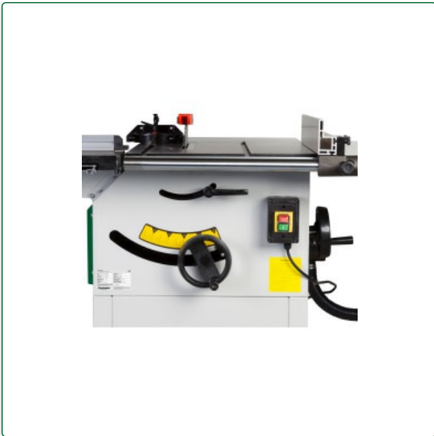
With accurate and smooth height and tilt adjustment of the saw unit through easy-to-use handwheel