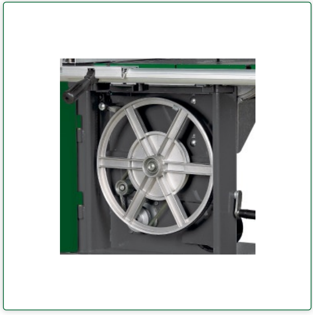
Illustration shows HBS 361-2 with optional accessory circular cutting device (5912436)