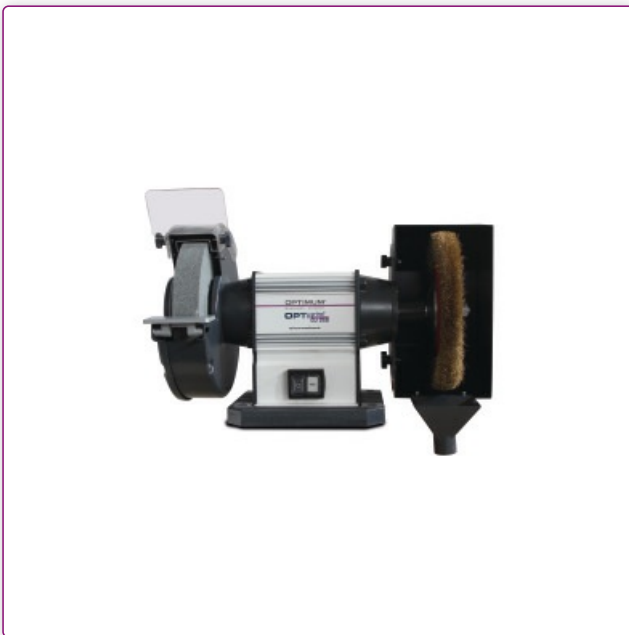
Figure shows GU25B