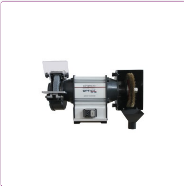
Figure shows GU25B