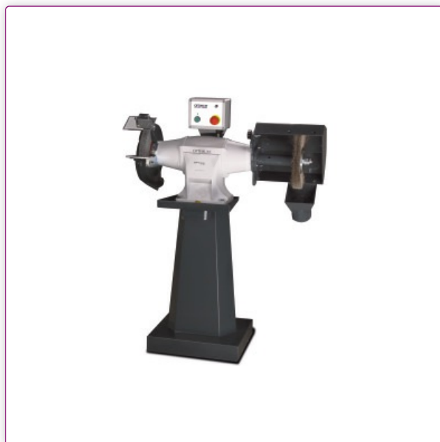
Fig.: GZ 20C with optional grinding wheel and brush