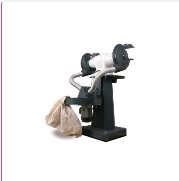
GZ 25DD with optional grinding wheels