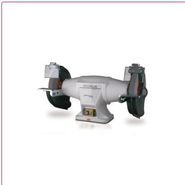
GZ 30D with optional grinding wheels