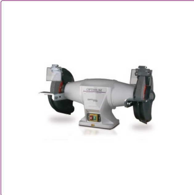
GZ 30D with optional grinding wheels