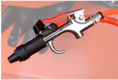
Cleaning pistol with dual function Cleaning and blowing out