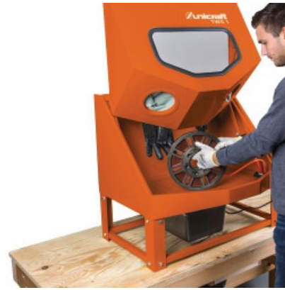
Due to the compact design, the cab fits on every worktable