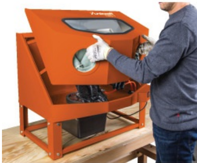
Large, smooth-running lid for quick and easy loading and unloading