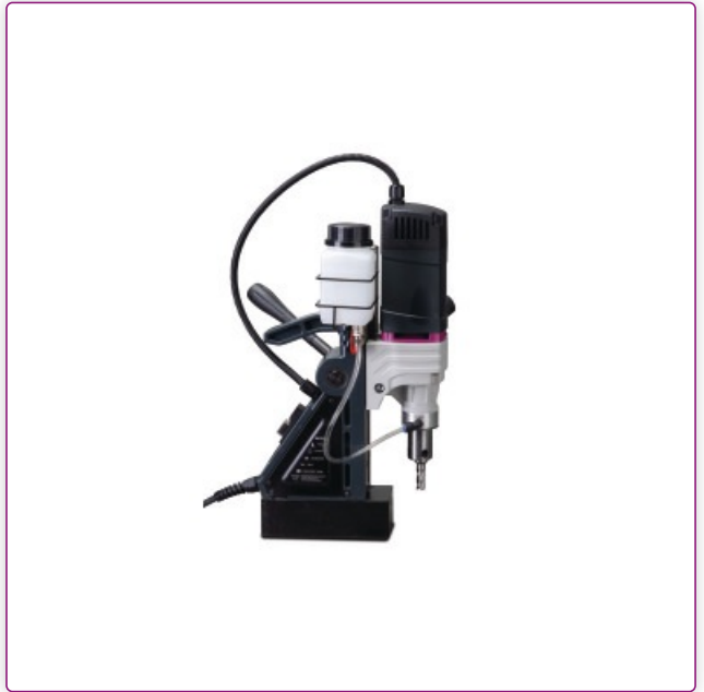
Picture with optionally available core drill