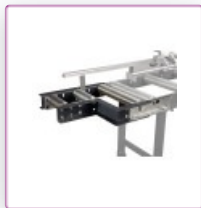
Table extension with alternating role MSR 1