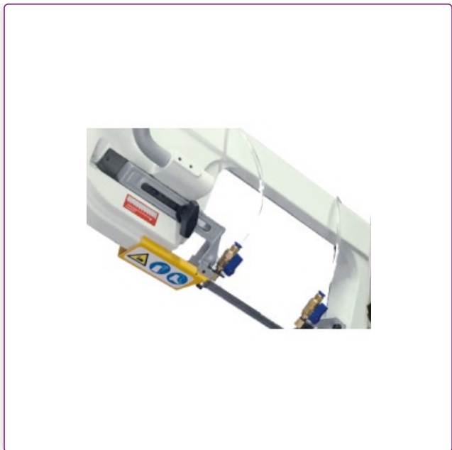
Saw band guide