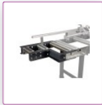
Table extension with alternating role MSR 1