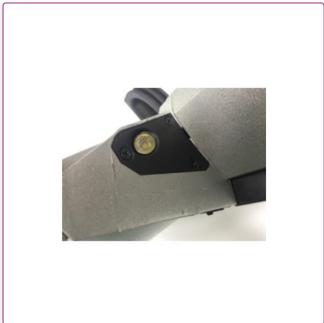
LED work light