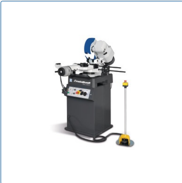
Illustration shows MKS 350 H