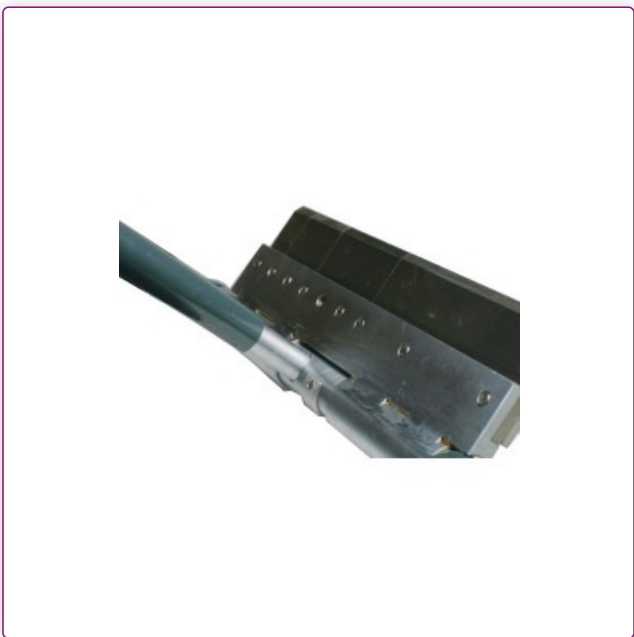
Figure shows bending machine OPTIMUM FP 30 mounted on bench vice (vice not included)