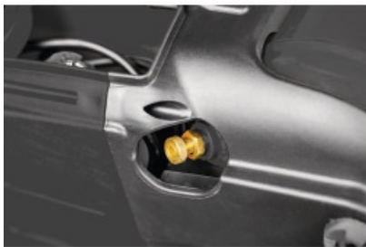
Condensate drain valve on the compressed air tank