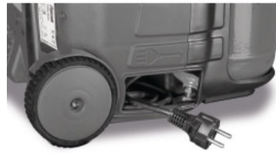
Storage compartment for the power line