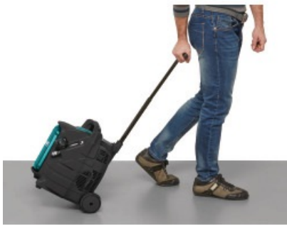
Sturdy plastic wheels and extendable handle for easy transport