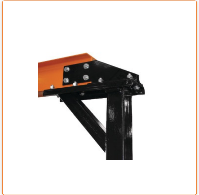
Stable design of the carrier supports