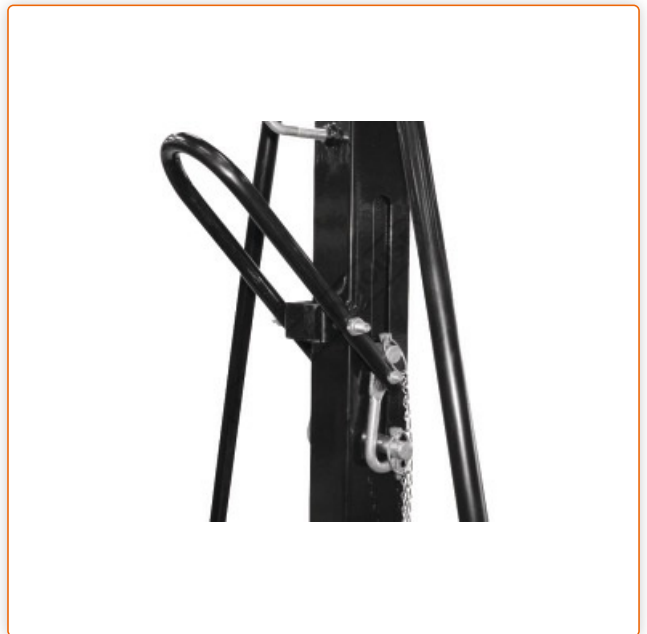
Safe and easy height adjustment in unloaded state via levers and two safety bolts per support carrier