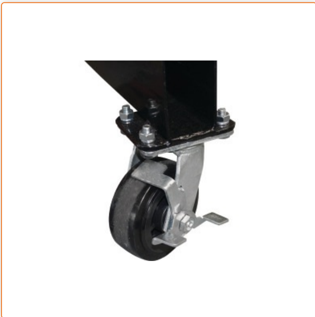
Steering rollers with parking brake