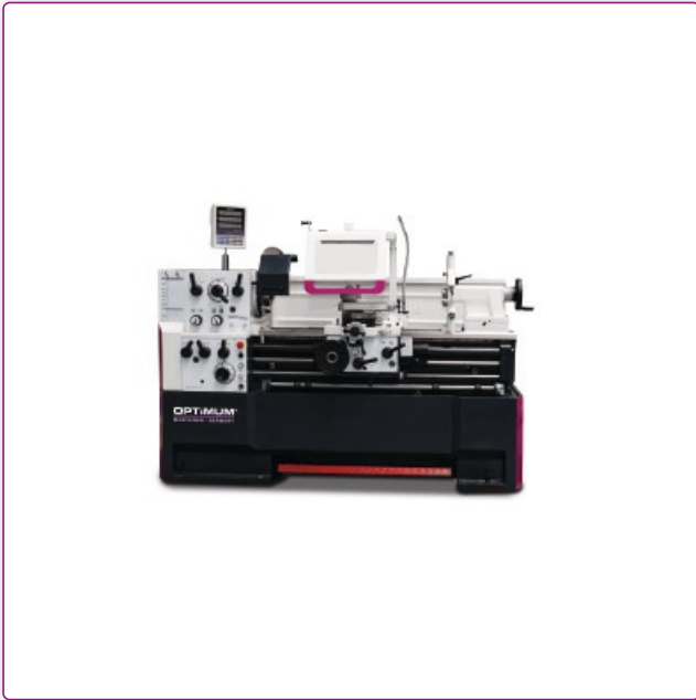
Figure shows OPTiturn TH 4615 with optional quality chuck from OPTIMUM