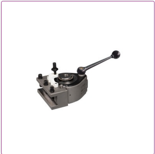
Quick-change steel holder SWH 5-B