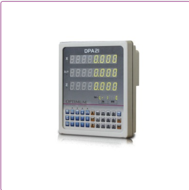
Dig. position indicator DPA 21