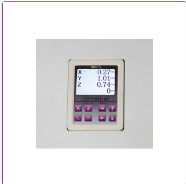
Digital position indicator DRO 5