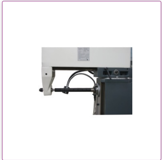
Horizontal milling position