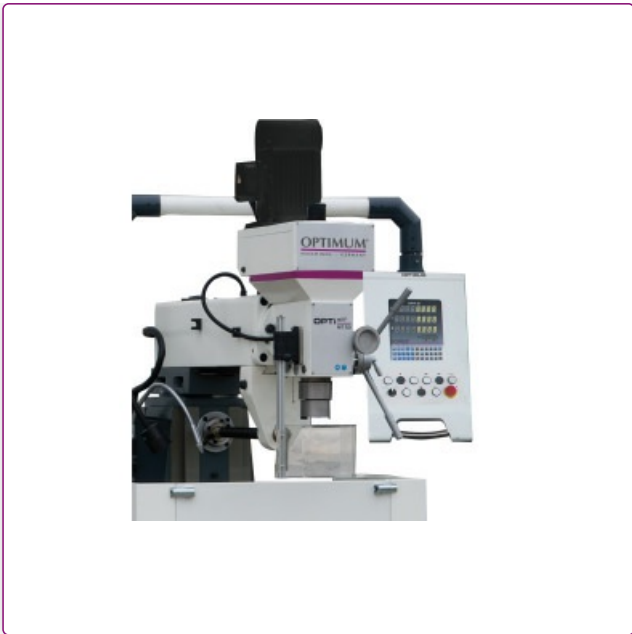
OPTI control panel