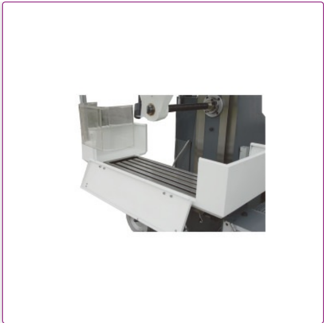
Cross table enclosure