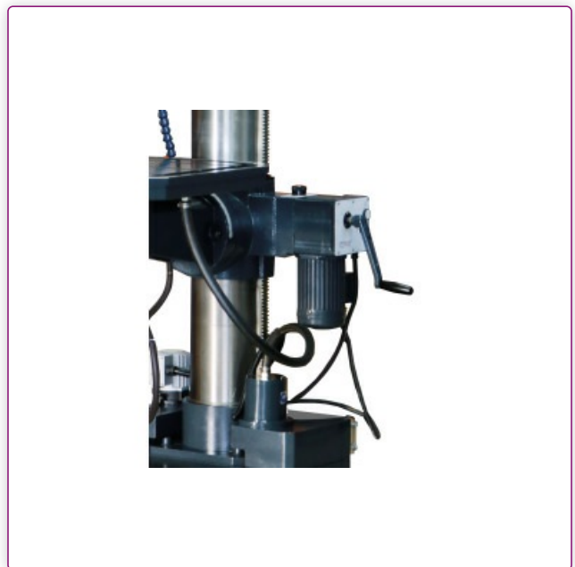
Table height adjustment