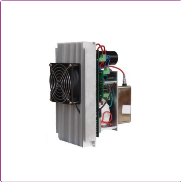
Powerful brushless drive